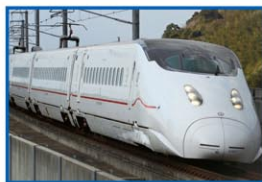
Kyushu Shinkansen "Series 800"