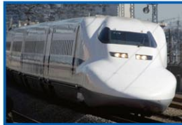
Tokaido & Sanyo Shinkansen "HIKARI"

Sanyo Shinkansen (622.3 km) Train Names: NOZOMI, MIZUHO, HIKARI (incl. HIKARI Rail Star), SAKURA, KODAMA (Tokyo thru Hakata, 1,174.9km)