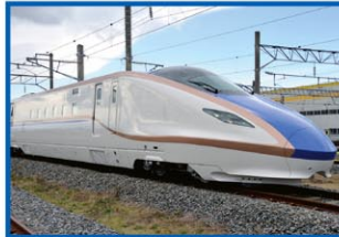
Hokuriku Shinkansen "KAGAYAKI" etc.

Yamagata Shinkansen (421.4 km) Train Name: TSUBASA