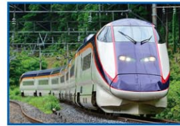
Yamagata Shinkansen "TSUBASA"

Akita Shinkansen (662.6 km) Train Name: KOMACHI