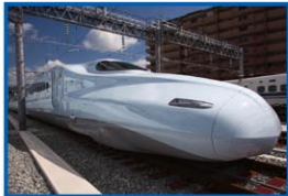
Sanyo & Kyushu Shinkansen "SAKURA"

Hokuriku Shinkansen (450.5 km) Train Names: KAGAYAKI, HAKUTAKA, TSURUGI, ASAMA