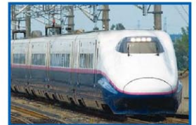
Tohoku Shinkansen "HAYATE," "YAMABIKO," etc.

Tohoku Shinkansen (713.7 km) Train Names: HAYABUSA, HAYATE, YAMABIKO, NASUNO