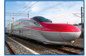
Akita Shinkansen "KOMACHI"

Joetsu Shinkansen (333.9 km) Train Names: TOKI, TANIGAWA Max-TOKI, Max-TANIGAWA