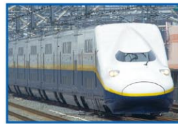
Joetsu Shinkansen "Max-TOKI" etc.

Joetsu Shinkansen (333.9 km) Train Names: TOKI, TANIGAWA Max-TOKI, Max-TANIGAWA