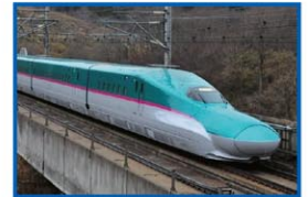
Tohoku Shinkansen "HAYABUSA" etc.